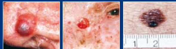
Basal cell carcinoma